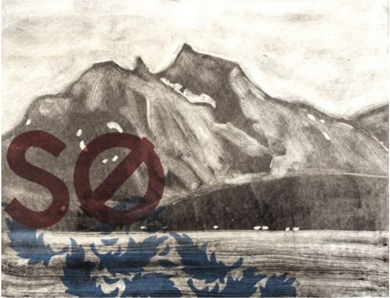
Tammy Ratcliff, Mountain View (...sø) , 2016, Lithograph and monotype with chine collé, 18.5"H x 22.5"W, $800.