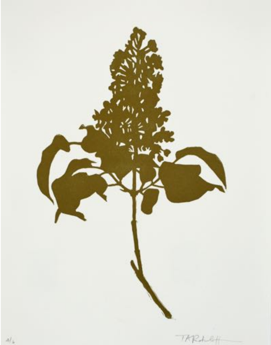
Tammy Ratcliff, Small Gold Branch (from the old house) , 2017, edition of 6, Relief print, 17"H x 15"W, $300.