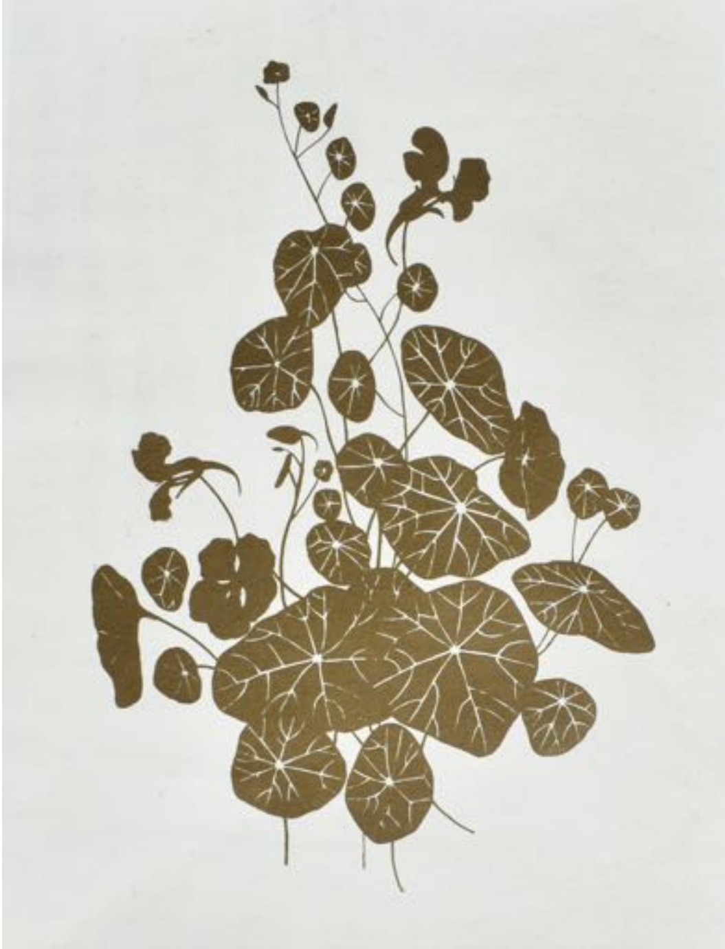
Tammy Ratcliff, Nasturtium Tangle , 2017, edition of 10, Lithograph with chine collé, 37"H x 29"W, $900.