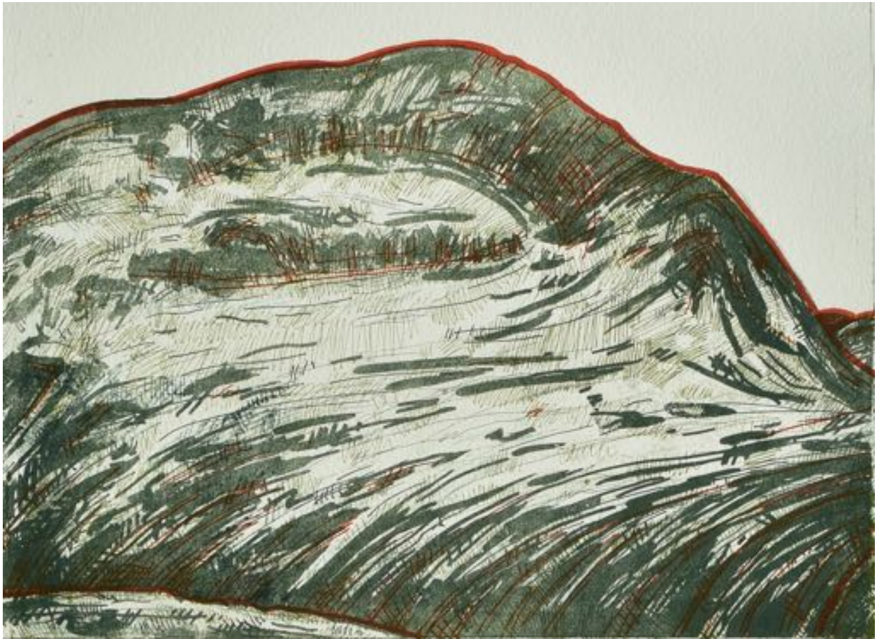
Tammy Ratcliff, Mountain Study I , 2016, varied edition of 14, Lithograph, 15"H x 18.5"W, $560.