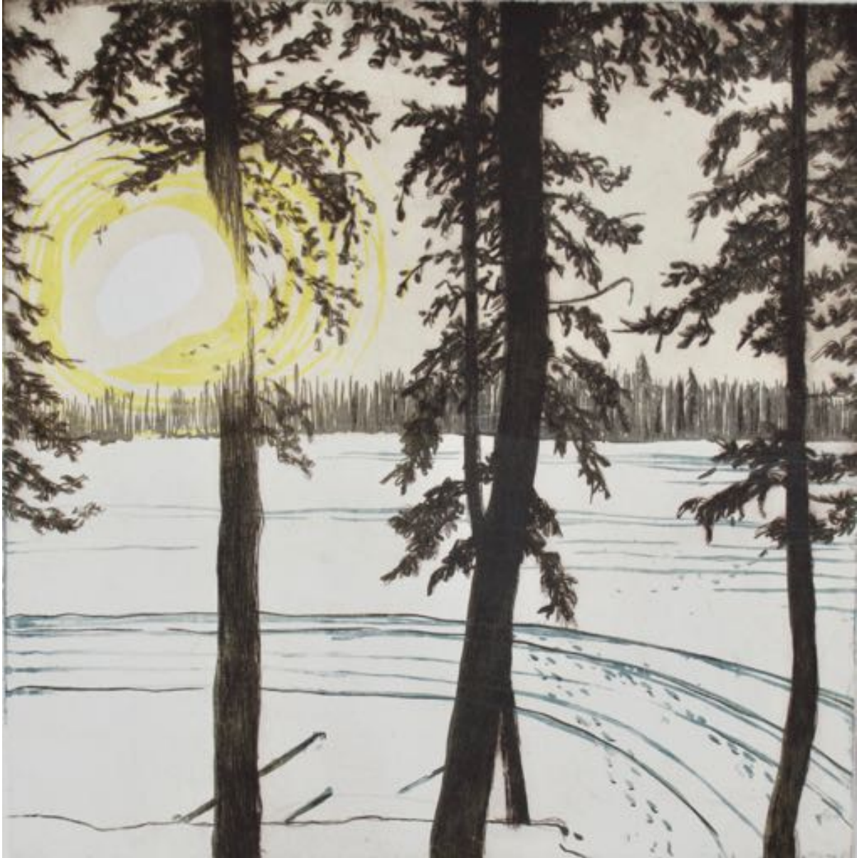
Tammy Ratcliff, Steenburg Lake , 2017, edition of 10, Lithograph and dry point with chine collé, 37"H x 29"W, $980.