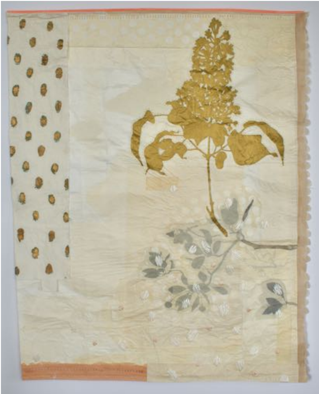
Tammy Ratcliff, Soft Party with Lilac , 2017, Lithograph and monotype on washi with hand stitching, 39.5"H x 31"W, $2600.