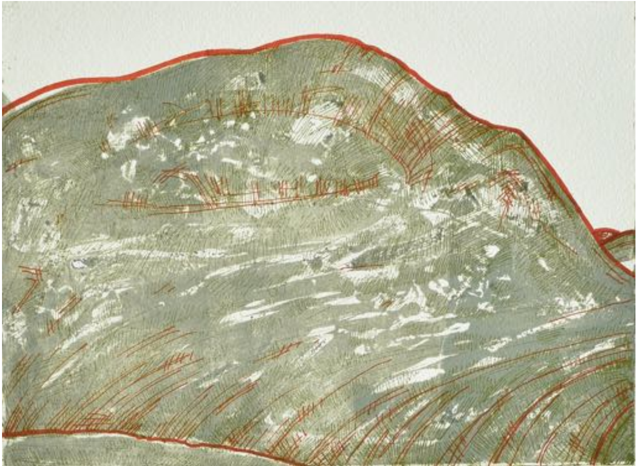
Tammy Ratcliff, Mountain Study II , 2016, varied edition of 14, Lithograph, 15"H x 18.5"W, $560.