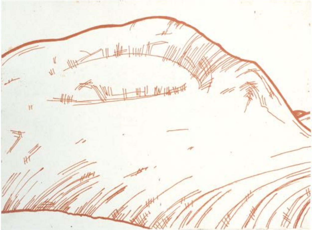
Tammy Ratcliff, Mountain Study IV , 2017, Lithograph monprint with chine collé, 15"H x 18.5"W, $560.