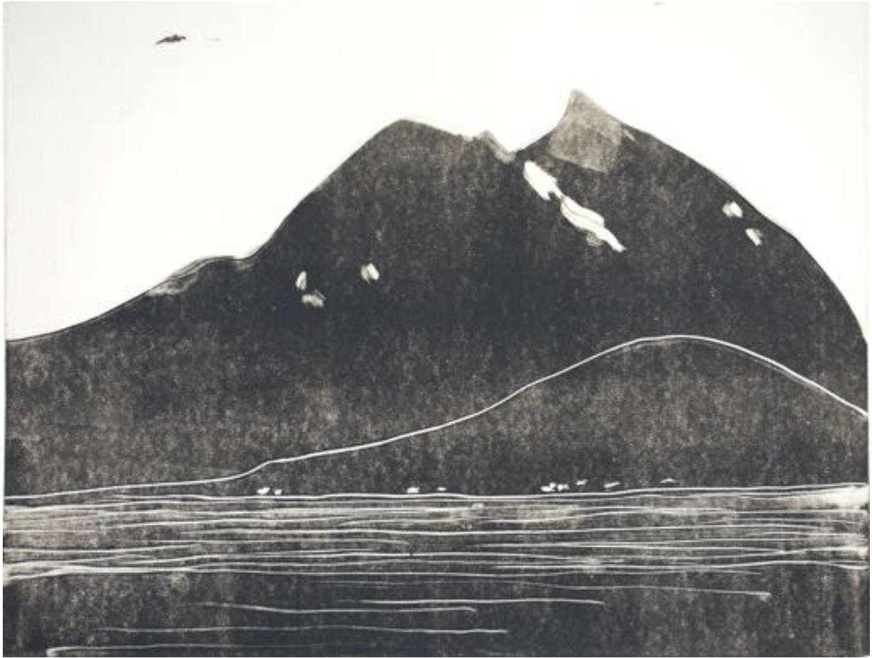
Tammy Ratcliff, Mountain View (Simple) , 2016, Monotype, 18.5"H x 22.5"W, $800.