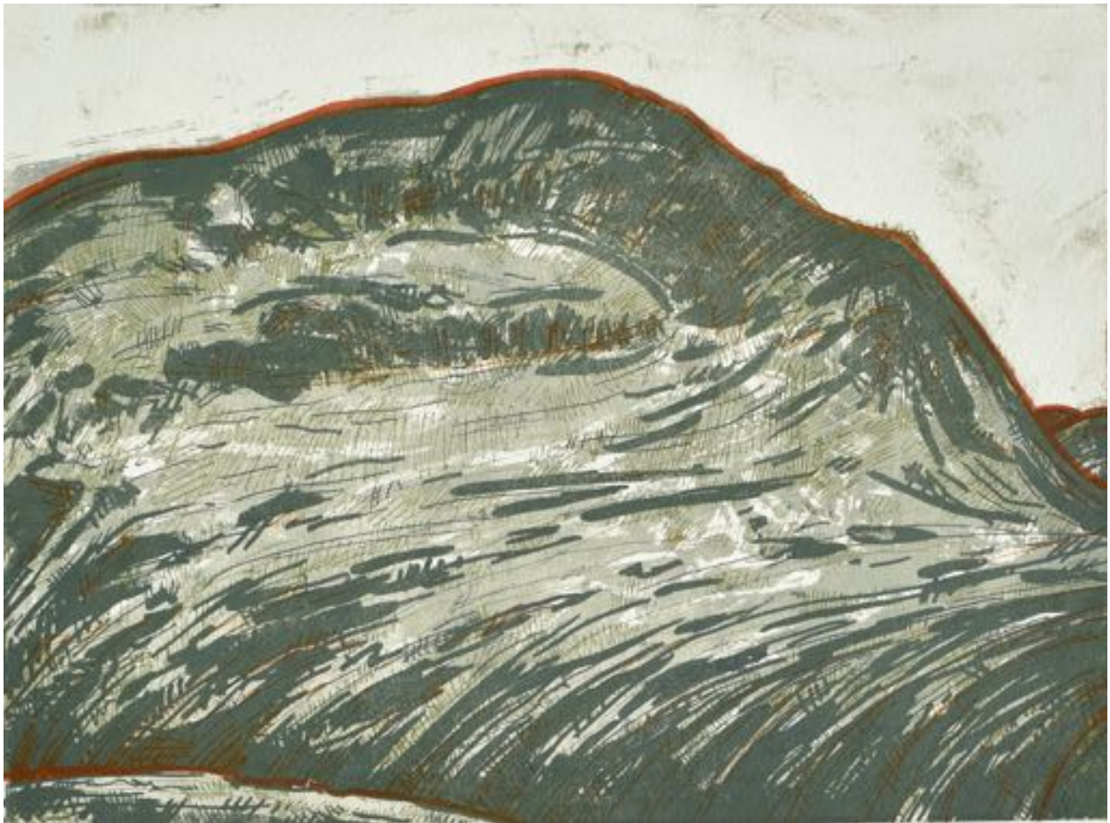
Tammy Ratcliff, Mountain Study III , 2016, varied edition of 14, Lithograph, 15"H x 18.5"W, $560.