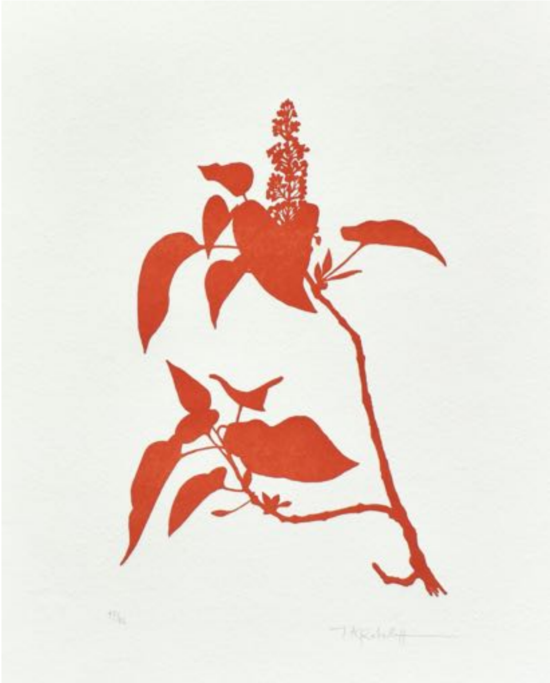
Tammy Ratcliff, Red Lilac (from Spark Box + Graven Feather ), 2015, edition of 88, Relief print, 17"H x 15"W, $220.