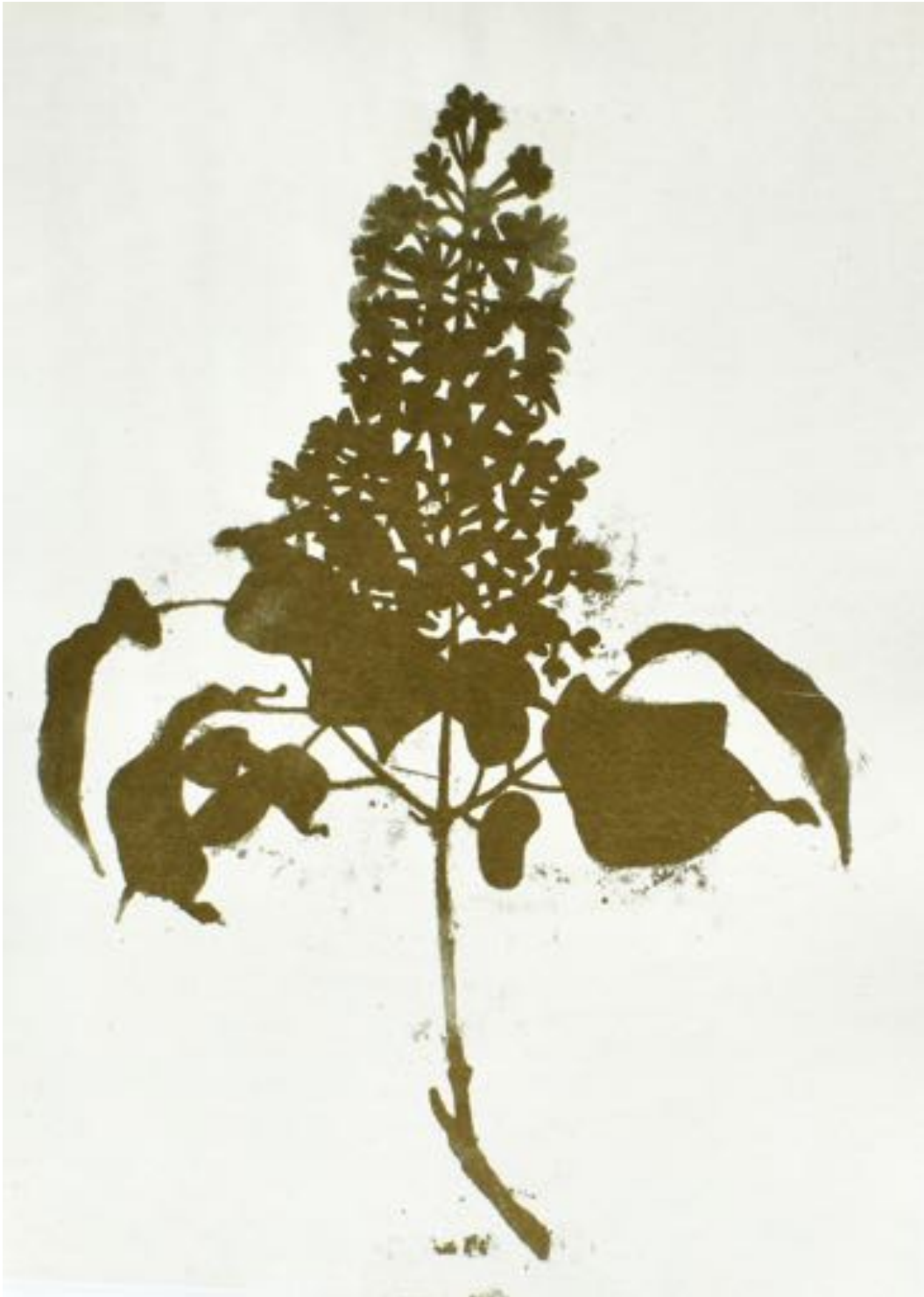
Tammy Ratcliff, Gold Lilac Panicle , 2017, edition of 4, Lithograph with chine collé, 37"H x 29"W, $900.