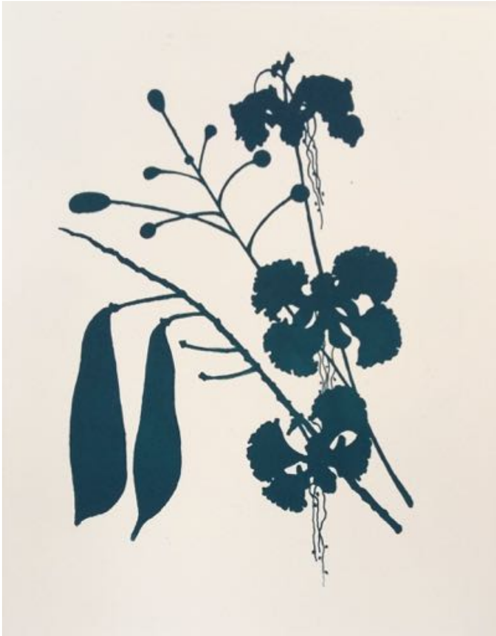
Tammy Ratcliff, Pride Tree (from Barbados) , 2017, edition of 6, Lithograph, 17"H x 15"W, $300.