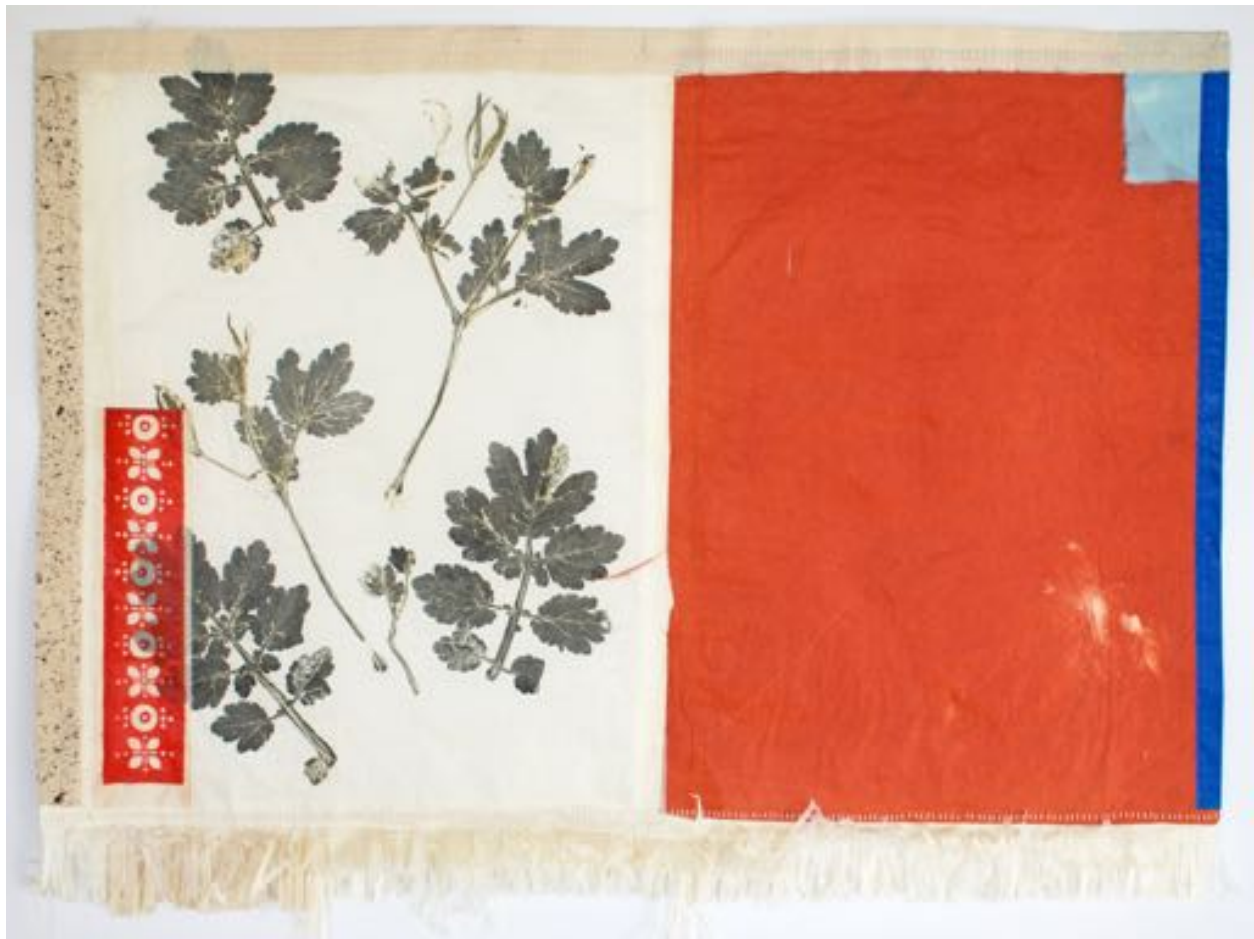
Tammy Ratcliff, Red Flag (from Troms Fylkeskultursenter ), 2017, Lithograph and monotype on washi with hand stitching, 31"H x 39.5"W, $2600.