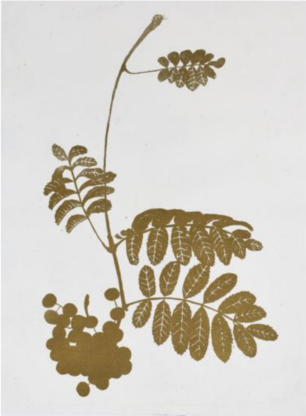
Tammy Ratcliff, Mountain Ash (from Oxford Street) , 2017, edition of 10, Lithograph with chine collé, 37"H x 29"W, $900.