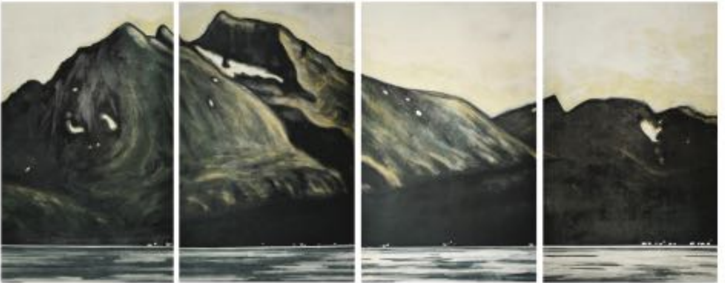
Tammy Ratcliff, Memento (from Tromsø) , 2017, Multiple colour monotype with chine collé, 45.5"H x 120"W (quadriptych), $4800.