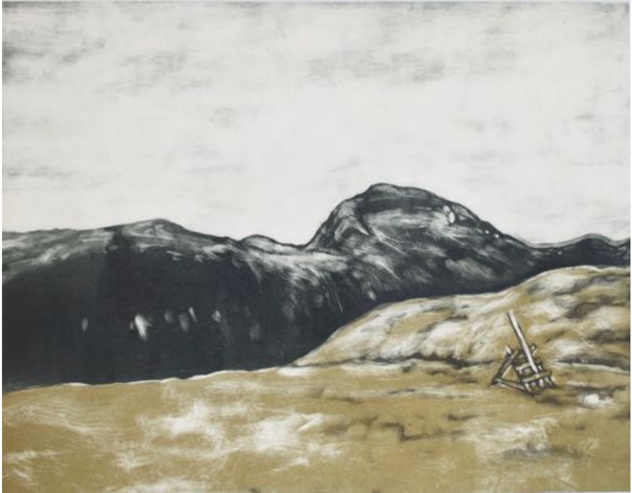
Tammy Ratcliff, The View II , 2017, Monotype with chine collé, 25"H x 31"W, $1100.