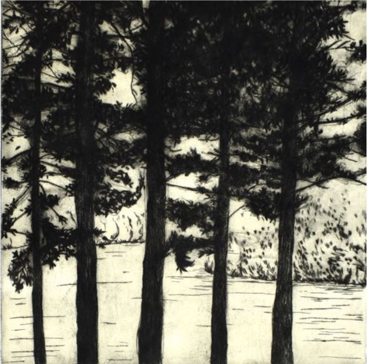
Tammy Ratcliff, Go Home (monochrome), 2017, Dry point monoprint with chine collé, 37"H x 29"W, $1100.