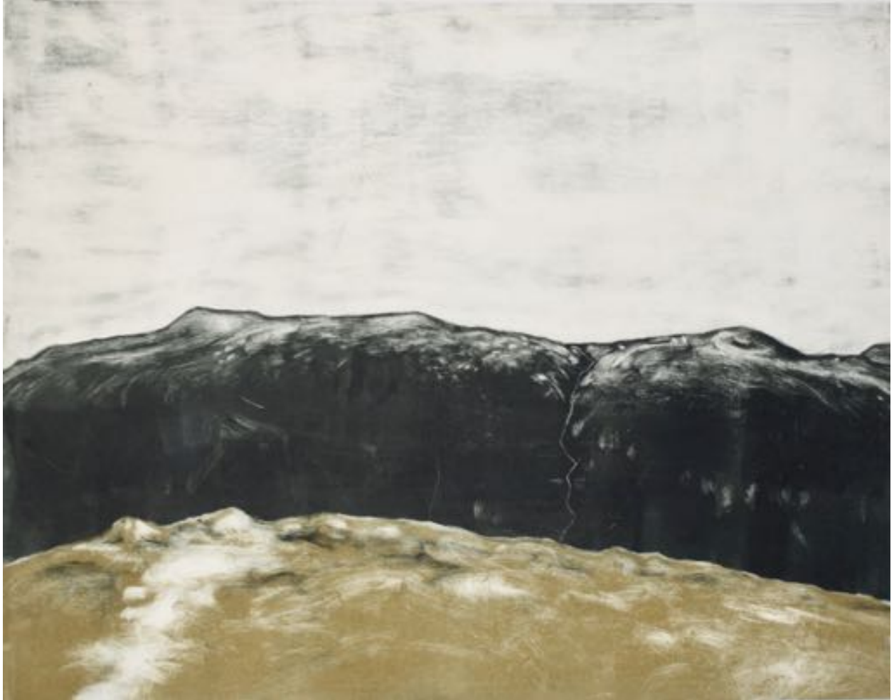
Tammy Ratcliff, The View I , 2017, Monotype with chine collé, 25"H x 31"W, $1100.